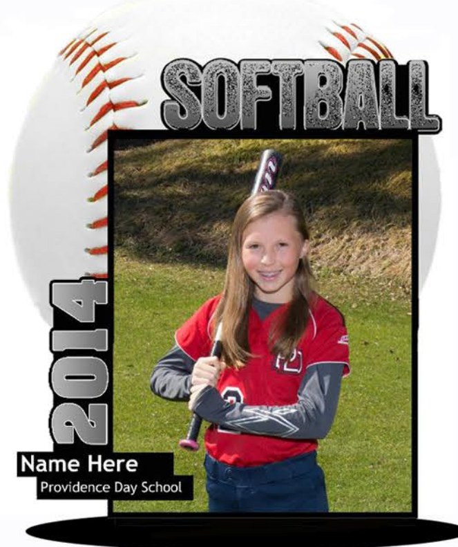
Stand-Up (available for all sports) Size 8x10