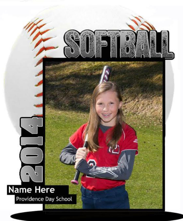
Stand-Up (available for all sports) Size 8x10